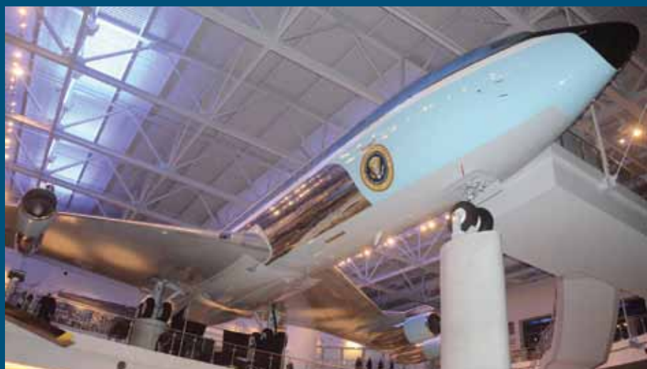
The 2012 "Twice A Citizen" Banquet was held in the Air Force One Pavilion at the Ronald Reagan Presidential Library. Story on page 4.