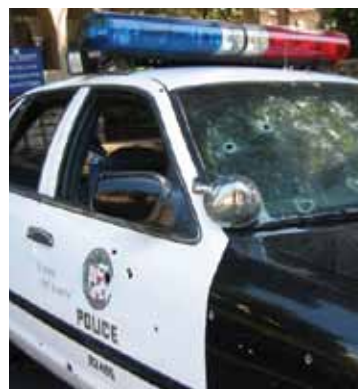
Shop #82405 from the North Hollywood shootout, with rounds from an AK-47. The vehicle is housed at the Los Angeles Police Museum (see page 9).