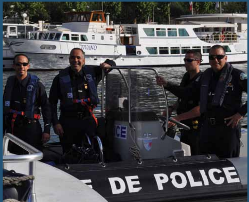
On a police patrol boat along the Seine River in Paris.