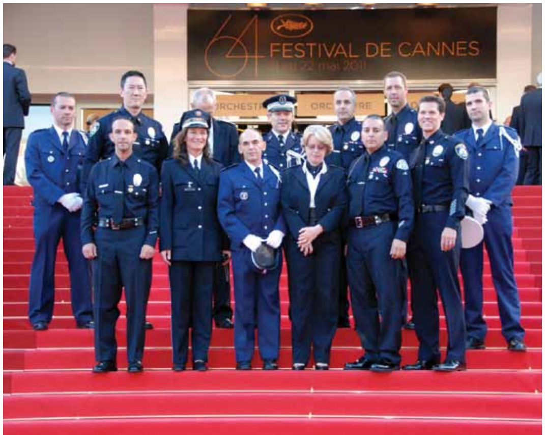
With French Municipal and National Police command staff on the red carpet of the Cannes Film Festival.

The third day of the visit was a daylong tour, in Class A uniform, of several units of the National Police in and around Paris. This included a visit to the RAID facility (the French equivalent of a national SWAT team). Officers were given a presentation on the structure and operation of the RAID units, a tour of the training facilities and a live demonstration of a hostage rescue. The delegation toured the Prefecture for Police in Paris headquarters, traffic and crowd control command centers, the motor unit and the special unit that polices the Seine River. They were given a demonstration of the unit's underwater search and rescue operations and its river patrol operations.