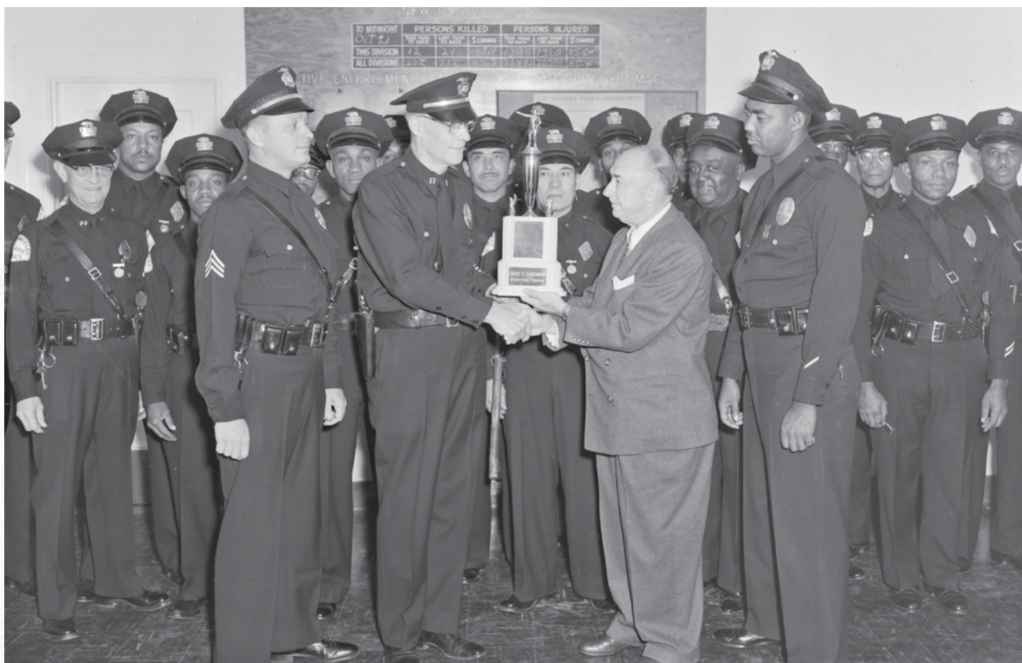
From the Los Angeles Police Museum archives: reserve officers at Newton Division, circa 1950.