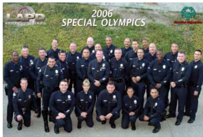
In 2006, 38 LAPD officers, mostly reserve, participated in the Summer Games ceremony of the Special Olympics. Below: Over 200 peace officers throughout Southern California participated this past year.