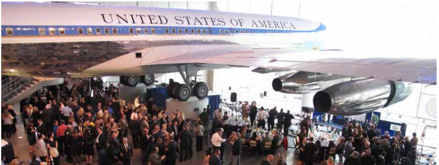
The "Twice a Citizen" Banquet was held in the Air Force One Pavilion at the Ronald Reagan Presidential Library, in Simi Valley.

BANQUET AT REAGAN PRESIDENTIAL LIBRARY, APPRECIATION DAY BBQ HELD AT PAB