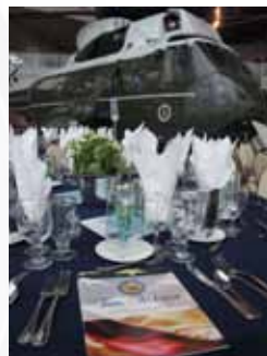
The banquet setting, with Marine One in the background.

entered the reception by walking through Air Force One and exiting into the festivities.